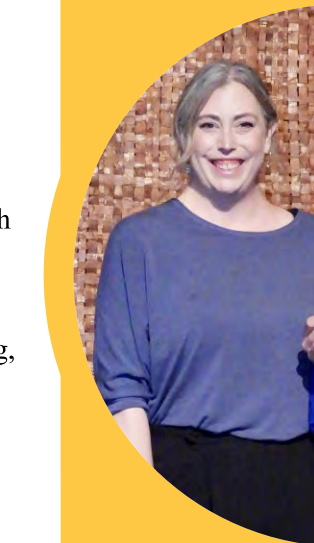
Congratulations who was awarded Award. He plans on of Jazz (Piano) at Applied Science Maastricht in