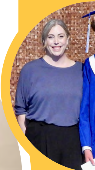
Congratulations of LDCU S Presented