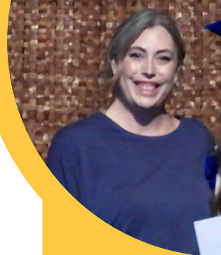
Congratulations recipient of LD Honour of Helm